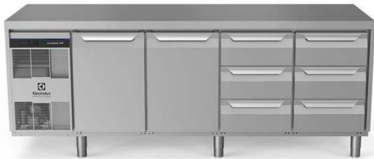
710082 (EH4HBAACC) 2-door and 6x1/3 drawer Refrigerated Counter 590lt, -2+10°C, AISI 304